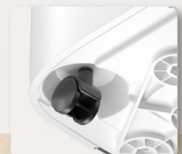
360° Universal Wheel