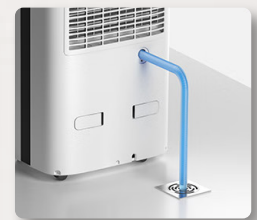
External Drain Pipe