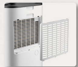
PET Primary Filter